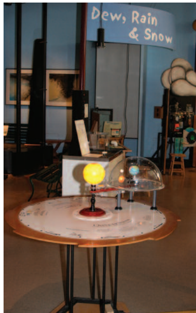
Weather section of the Experiment Gallery

How does the angle of the sun affect the amount of energy?