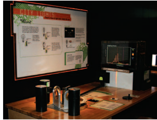
Light section of the Experiment Gallery

This large wave tank is next to the steps leading to Level 4.