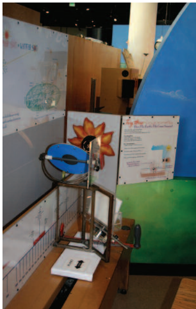
Weather section of the Experiment Gallery

Is there light that is not visible to your eyes?